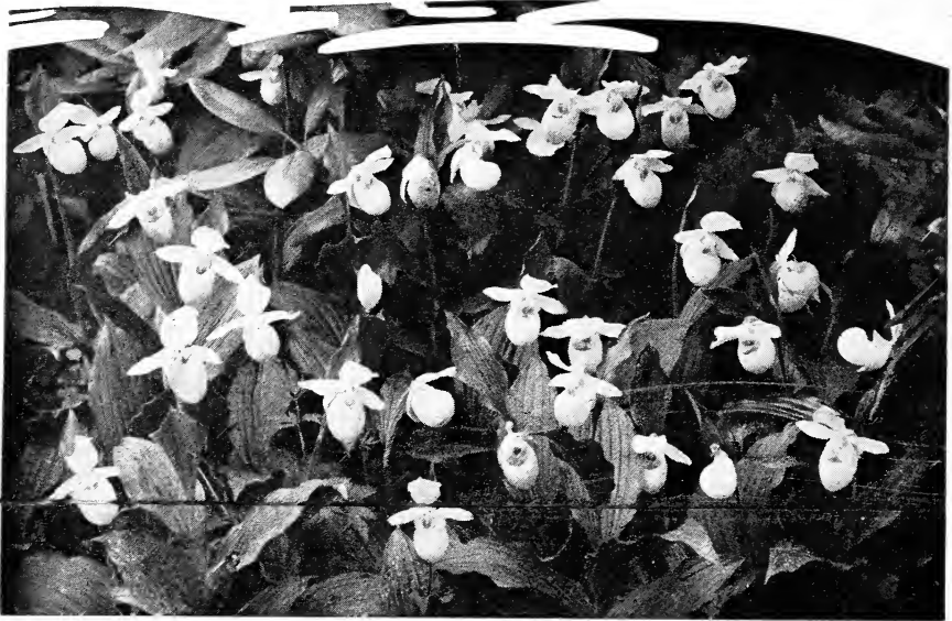
Cypripedium spectabile. See page 6